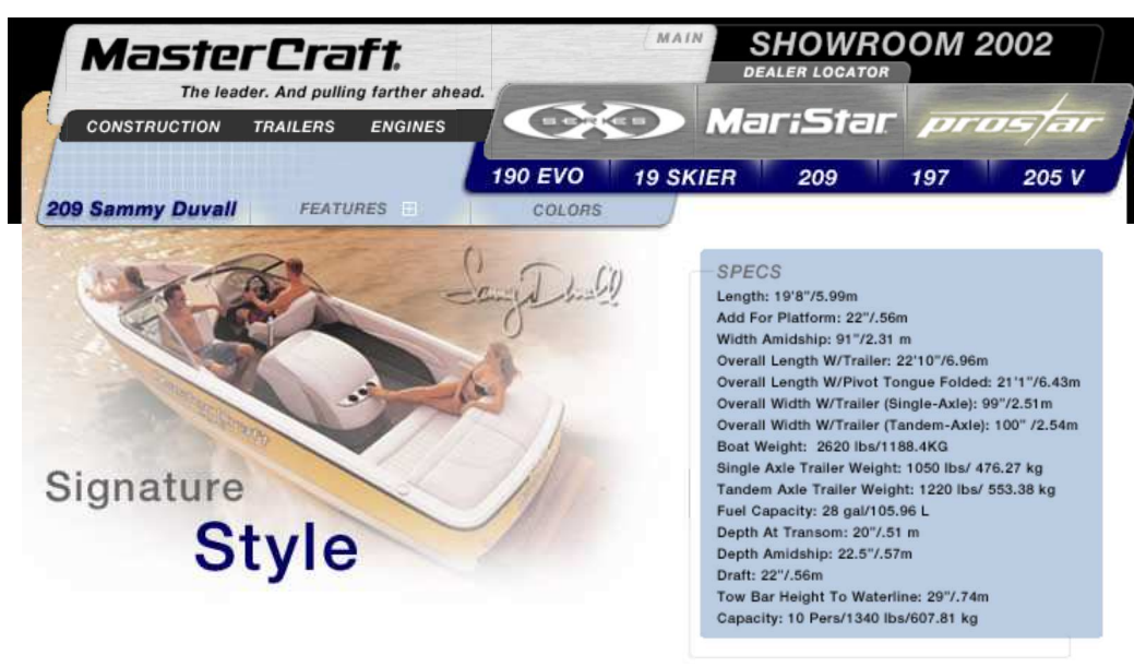
Click here for a high resolution image

You love the ProStar 209 because you get the best of both worlds. A tournament bred ski machine with a spacious open bow and enough room to appease your nuclear family. But just because you're practical doesn't mean you can't be sophisticated.