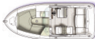
Optional Seating Plan

Double-Wide Helm Seat, w/Flip-Up Thigh-Rise & Fiberglass Storage Base Port Back-to-Back Lounger Aft Jump Seats (Forms Bench Seat) Motorbox