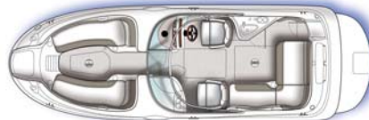
Optional Seating Plan Bucket Seats (2), w/Flip-Up Thigh- Rise; Slider & Swivel Functions L-Shaped Lounger, Port Motorbox

Sea Ray Boats, 2600 Sea Ray Blvd., Knoxville, TN 37914. For information call 1-800-SRBOATS or fax 1-636-326-3282. Internet address: http://www.searay.com