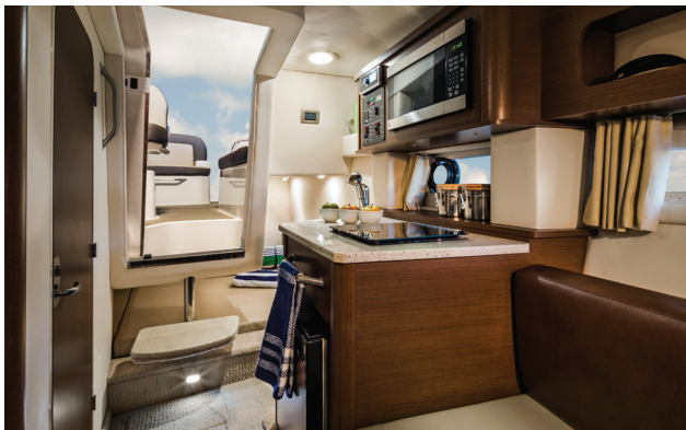
Hot features in the galley include a microwave, refrigerator, storage and you can add an optional stovetop.