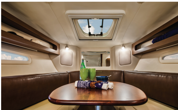
The V-berth transforms into a dinette with a solid wood table, or becomes a bed with cushion insert.

The unbeatable style and functionality of our 260 Sundancer inspires extended trips. Simply trailer it wherever you want to go, then hit the water and enjoy all the ingredients you need for an epic cruise: comfortable V-berth and mid-berth, open cockpit with reversible helm seat and wet bar, full galley and head, and plenty of storage. Just sit back and surge ahead.