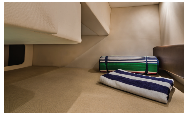
The convenient mid-berth has a double bunk, lighting and curtain for privacy. You can add a window for natural lighting.