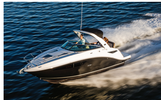
Stylish hull side windows provide abundant natural light to the interior.

ABYC Sponsor of ABYC Marine Certification School