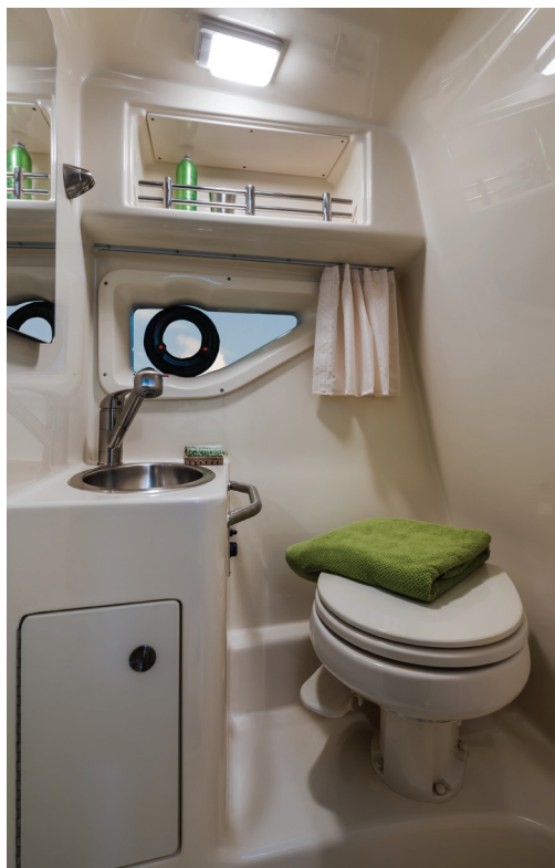
The full fiberglass stand up head includes a convenient portable head or optional VacuFlush® head with holding tank.