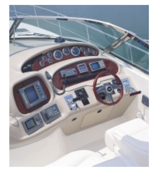
At the helm, the captain enjoys a wood-accent tilt wheel with hydraulic steering and dual gear shift and throttle controls.