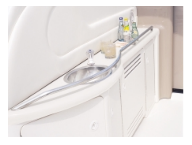
The portside refreshment center includes a wet bar with sink and faucet, an icemaker and plenty of storage underneath.

A custom adjustable helm seat with armrest and flip-up thigh-rise, a spacious companion seat with storage below and a large U-shaped aft seat with sun pad and table provide plenty of socializing and sunbathing room.