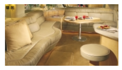
The opulent salon includes a leather sofa with electric slide-out bed, skylight, hi-lo dining table, and complete entertainment center with stereo, TV and VCR, plus antenna and TV coax to dockside.