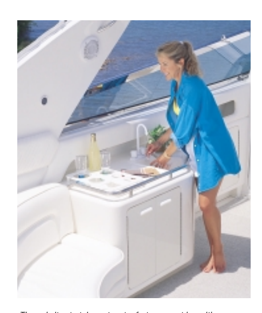
The cockpit entertainment center features a wet bar with refrigerator and icemaker.