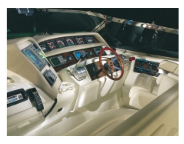
The custom slide/swivel helm seat puts the captain in comfortable command of a complete array of easy-to-see, easy-to-reach instrumentation and controls.