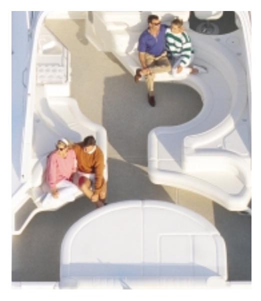
The well-designed seating plan includes aft-facing wraparound lounge seats with storage, plus a circular, raised deluxe sun pad with headrest.