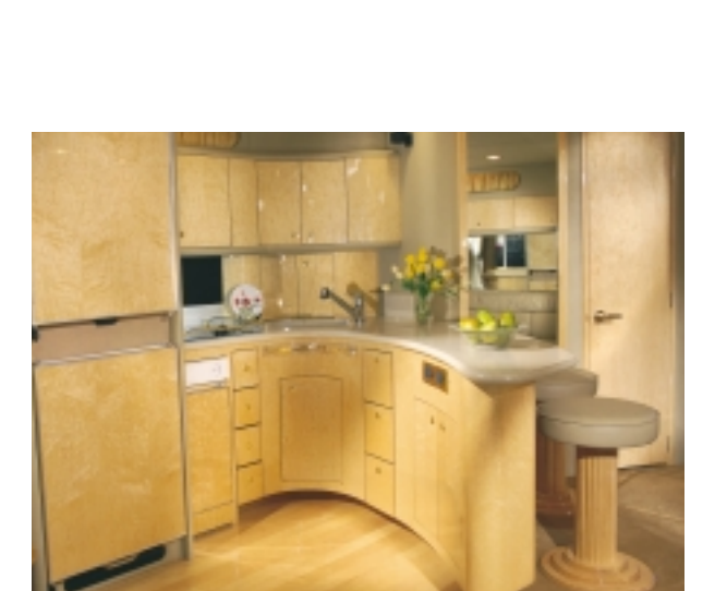
In the galley appliances include a refrigerator and freezer with icemaker, custom four-burner electric stove, and microwave/convection oven.